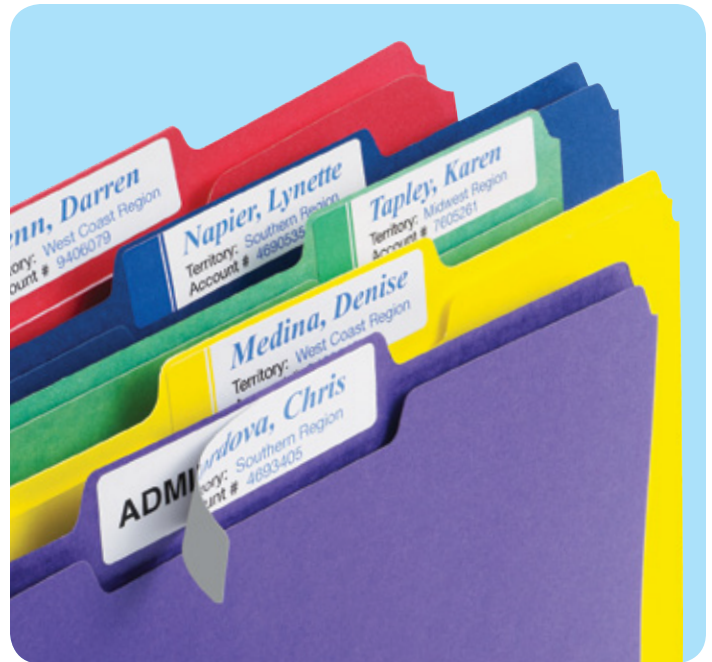
Extra large shown above