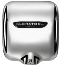
XL-C-ECO Chrome Plated