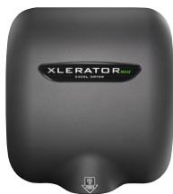
XL-GR-ECO Graphite Textured Painted