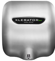
XL-SB-ECO Brushed Stainless Steel