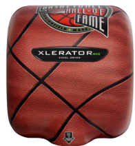
XL-SI-ECO*** Custom Special Image