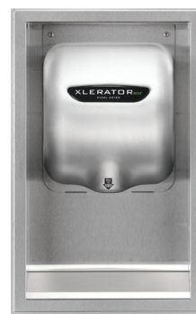
Part # 40502